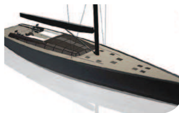
CNB 100 courtesy Luca Brenta Design